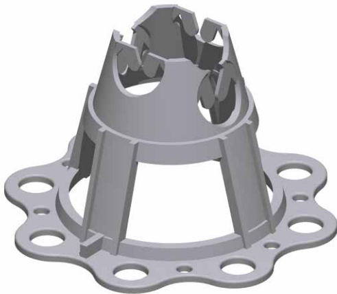
Up to a #5 Rebar and Mesh

The Mesh Bar Chair with Base (MBCB) is a light duty, composite chair with sand plate for use on soft surfaces and/or slab on grade to correctly position and hold the wire mesh securely in place. Each size chair is designed to service two mesh positioning heights. It is available in heights from 5/8" to 6". It can be used to support up to a #5 rebar.